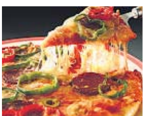
Choose from an array of pizzas at Pizza By The Bay

I like the place for its simple and light