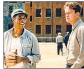
A still from The Shawshank Redemption

It makes me cry while I smile and make me smile while I cry. It lingers on my mind and leaves a lump in my throat every time I watch it.