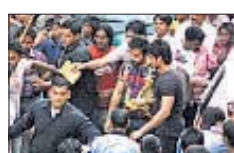
Emraan was mobbed in Delhi