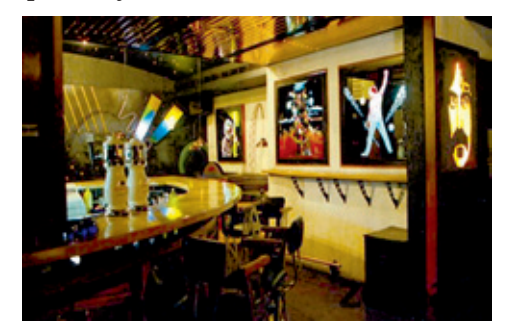
PURPLE HAZE, RESIDENCY ROAD:It is one of the best pubs in Bengaluru. The variety of drinks offered along with their happy hours slots make it an inviting chill

JAM HUT, HENNUR: This is our enlightenment spot, where we have our jam sessions and make music. It is also a good place to just unwind and chill out.