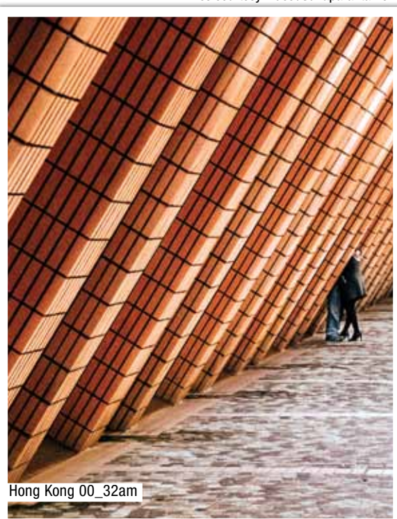
Hong Kong 00_32am