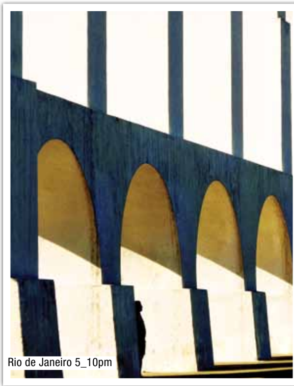
Rio de Janeiro 5_10pm

That's how Episodes (without a real order) was born, capturing fragments of real life that provokes a strong story narration, drawing directly from the mind of the observer. That's why my images induce